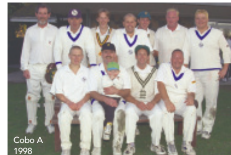
Cobo A 1998