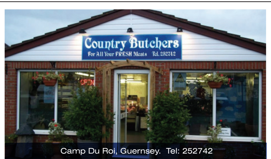
Camp Du Roi, Guernsey. Tel: 252742