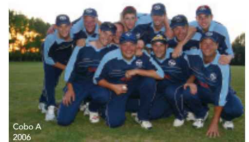
Cobo A 2006